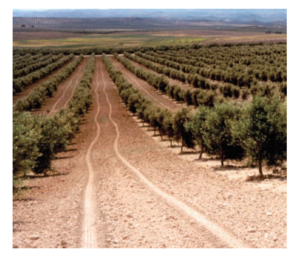
An example of spatial variability of soil organic carbon content

Roots are a great contributor to soil organic matter. Grassland produces deep roots that decay deep in the soil. Forest soils in contrast rely primarily on the decay of surface litter for organic matter input. Crops produce more above-ground biomass than roots. The organic matter input on cropland depends on the land management practices, including whether crop residues are removed or left behind.