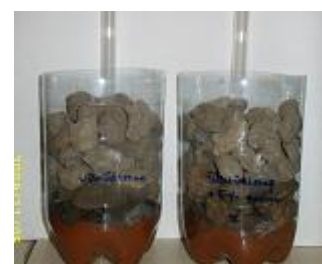
Figure 2: Red mud + concrete (20–30 mm fraction) in PET bottles

In case of 17 mm precipitation (average large rain event) 80–90 mm (concrete) and 90–100 mm (brick) fringe height was measured, which means that both materials can suck up 4.7–5.9 times the original height of the water. Therefore in case of a heavy rain event or flood, there is a need for an appropriately designed capillary block layer, which is able to block the upward filtration of water so that it should not reach the capillary layer.