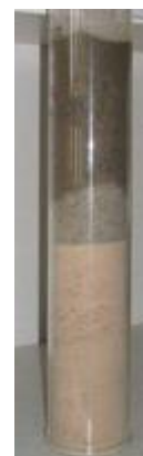
Figure 5: Water infiltration into the top (grey soil) layer (25 cm) after 5 days. Bottom layer: 25 cm brick.

At larger scale we followed the infiltration (11 mm model precipitation per day) for 8 days into: 1. 25 cm top layer (grey soil) and 25 cm capillary layer (brick) (Figure 5); 2. 50 cm top layer and 50 cm capillary layer. In the first experiment the water front reached the bottom of the top layer by day 7. In the second experiment the water front reached 36.2 cm from the top by day 8. This validated that for the top layer 50 cm should be enough under the modelled weather conditions.